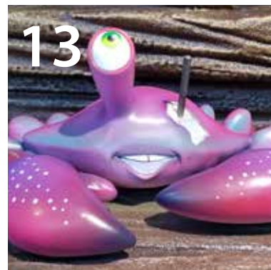
DAMAGE & WARRANTY