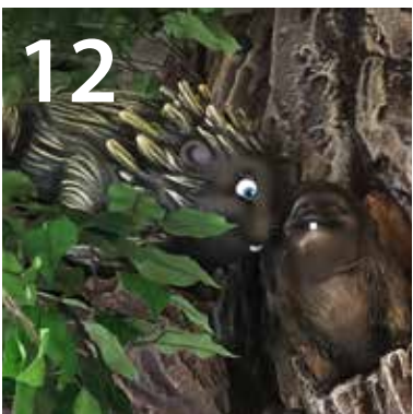
FREQUENTLY ASKED QUESTIONS