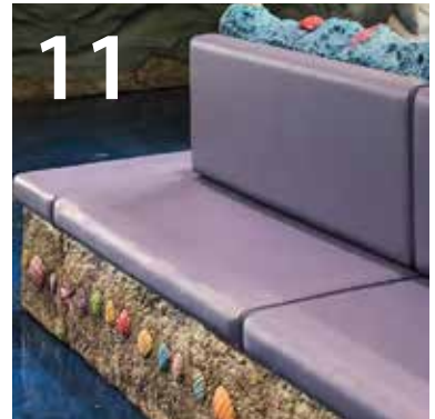
BENCHES & UPHOLSTERY